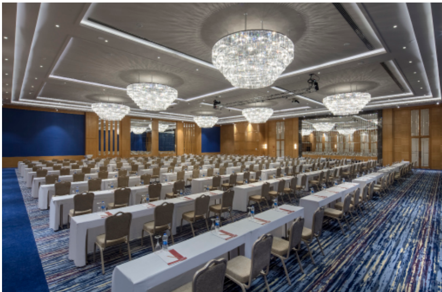
Tourmaline Tourmaline 1 Tourmaline 2