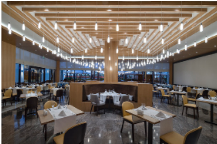
Trendy Main Restaurant