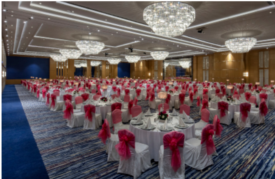
Tourmaline Tourmaline 1 Tourmaline 2