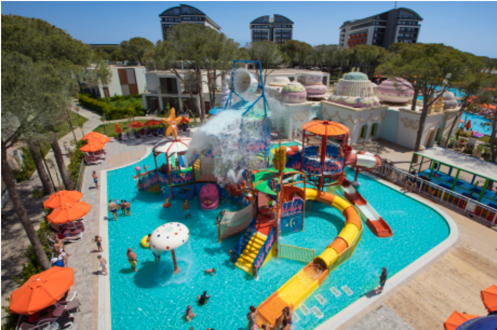
Kids - Aquapark