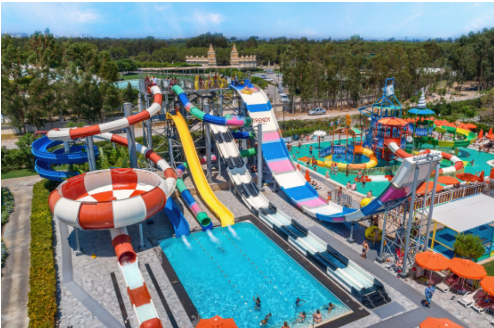
Adults - Aquapark