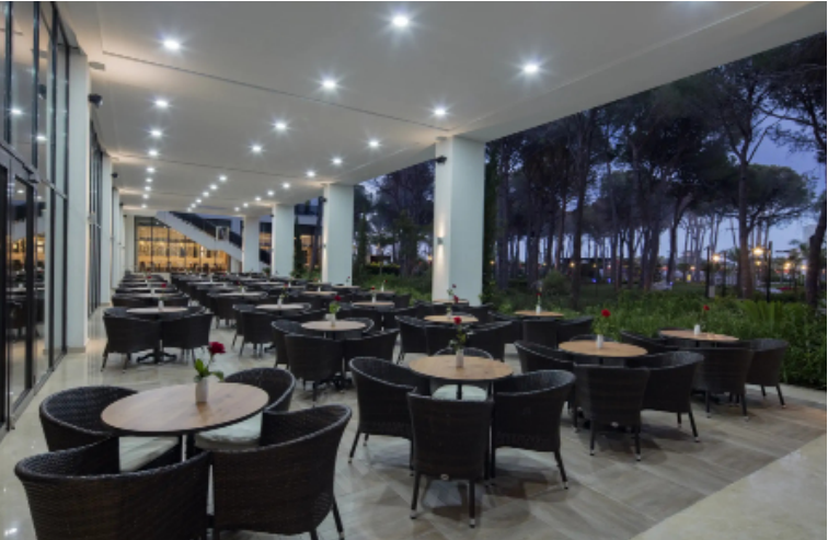
Eclair Coffee Lounge