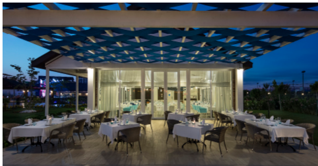
El Compadre ( Mexican Cuisine)