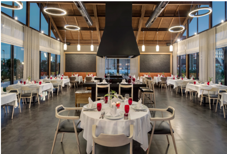
Sakamai (Far East cuisine)