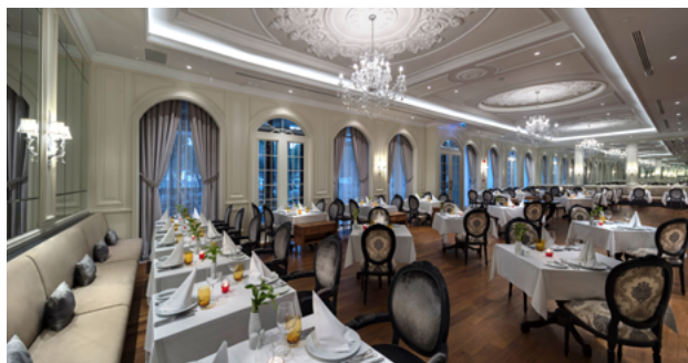
Noma (World Cuisine)