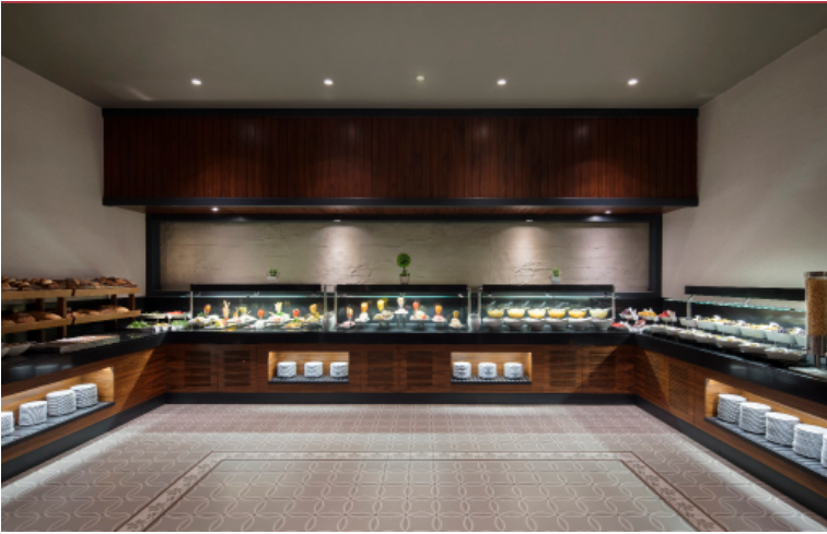
Dom Bistro Restaurant