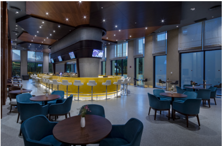
N - Joy Sport Bar