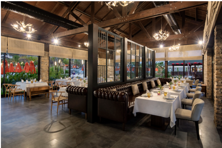
The Red (Steak House)