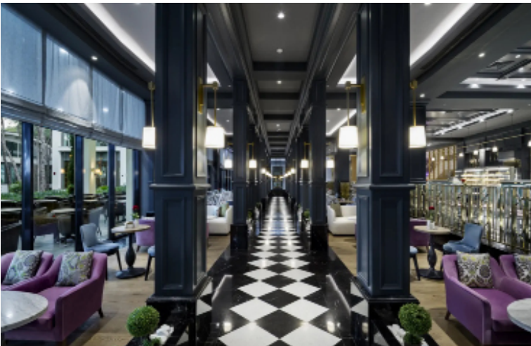
Eclair Coffee Lounge