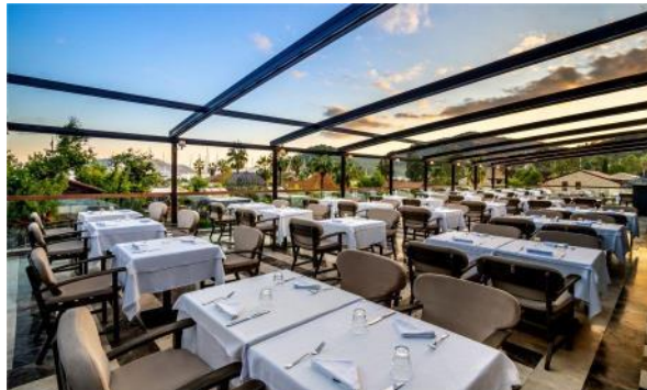
Turquoise Main Restaurant (Open Buffet)