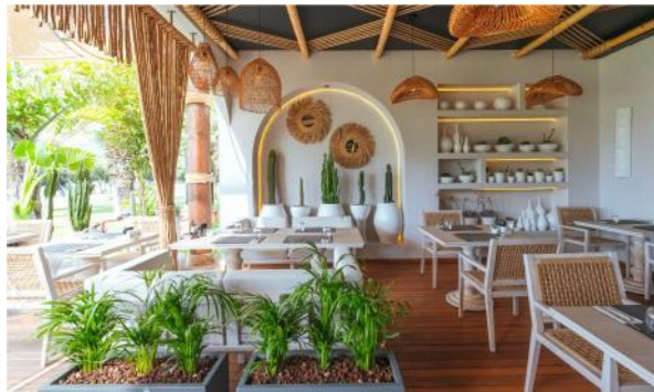
People's Restaurant (À la carte)