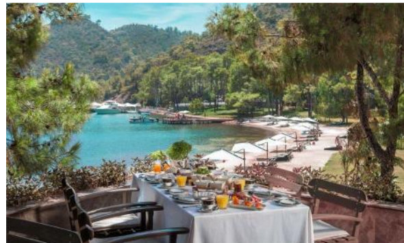
Azur Restaurant (À la carte)